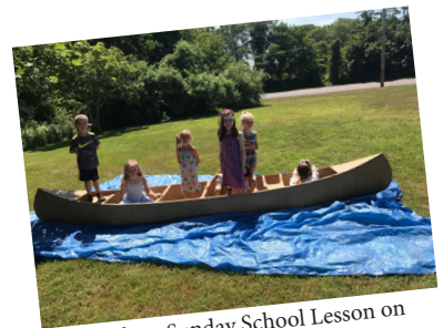
Outdoor Sunday School Lesson on Jesus Calming the Storm.