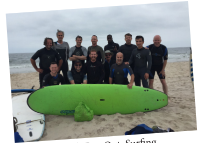
Guy's Day Out: Surfing

Each night, part of the gospel was presented to the children through an allegorical skit where the main character, a young boy symbolizing us, went on a journey with the Survival Guide who symbolized God and created all the trails. Each day of the story focused on part of the gospel story, highlighting God's plan through creation, the fall, redemption, and restoration. The week was filled with a lot of laughter and excitement. On the final night, we hosted a BBQ for over 200 people complete with a fire pit and s'mores, and we ended GraceCamp 2017 in the sanctuary with a slideshow that highlighted the memories made during this joy-filled week.