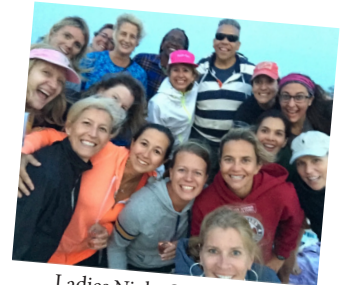
Ladies Night Out: Paddle